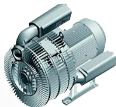
Three side-channel pump