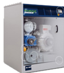
Sound-proofed three-lobe pump