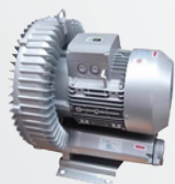
One side-channel pump