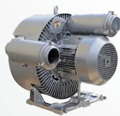
Two side-channel pump